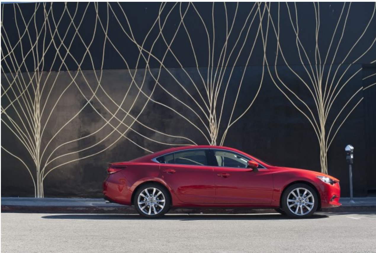
The 2014 Mazda6.

I think the Mazda6 is the best-looking car in the mid-size sedan segment. That's a good start for Mazda — which needs a stronger competitor — since good looks always get customers into showrooms. And many of the other elements that go toward making a car a segment leader are here. But do good sense and a bit of flash give the Mazda6 enough momentum to overcome a few flaws?