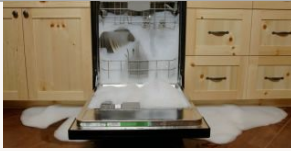
How To Load Your Dishwasher the Smart Way