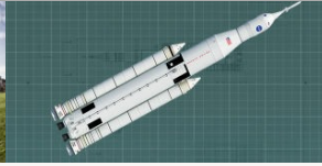
The Space Launch System Is a Big Rocket With...