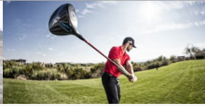
Boeing Used Aerodynamics To Build a Better Golf...