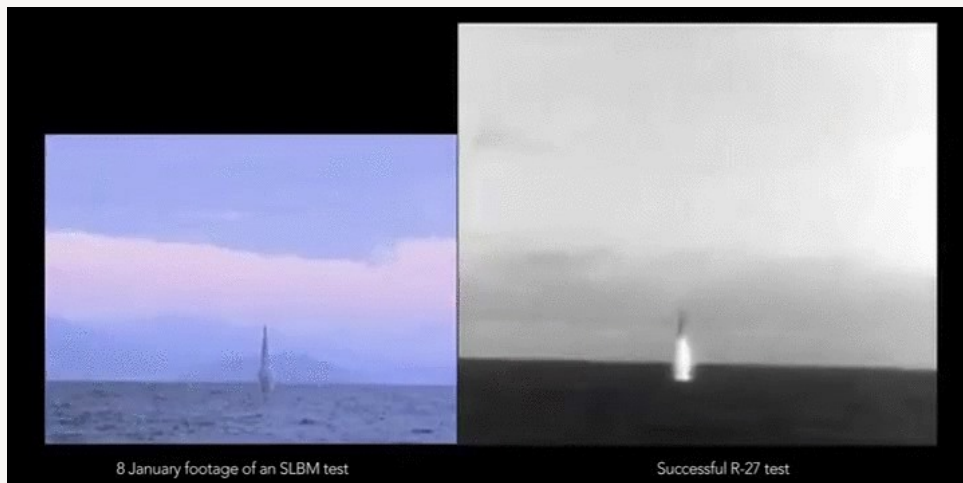
8 January footage of an SLBM test