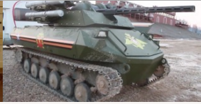
The Kremlin's Tiny Drone Tank Bristles With...