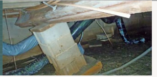
23 Totally Cringeworthy Home Inspection Nightmares