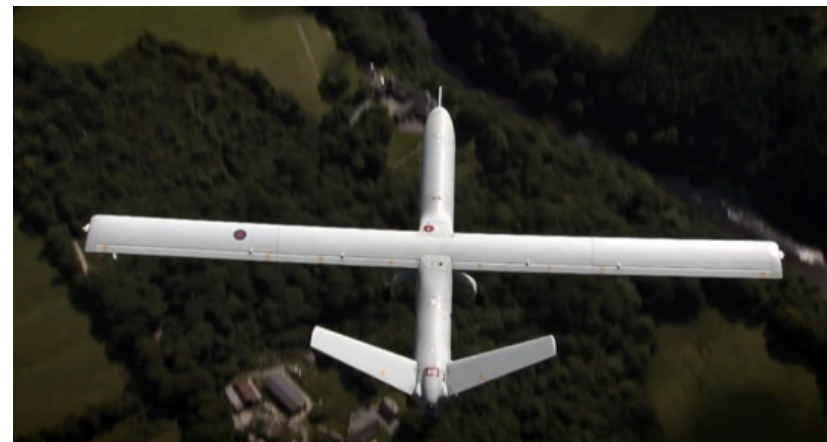
Thales Watchkeeper WK450 UAV