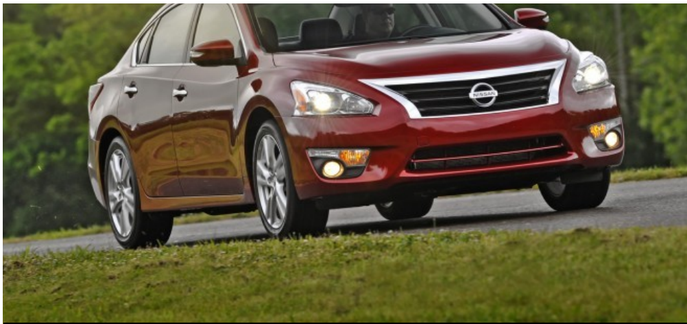
The 2013 Altima sedan.

Less impressive is the hybrid electronic-hydraulic power-assisted steering, which is progressive, but numb. The Altima comes with but one transmission, a substantially overhauled continuously variable transmission (CVT) that contributes to fuel efficiency with a 40 percent reduction in friction. I'm still not a fan of CVTs, and in the Altima, selecting "Sport mode" doesn't produce a discernible performance increase. But its affect on the Altima's mileage numbers (27 city, 38 highway) in concert with the weight reduction generates some very good fuel efficiency.