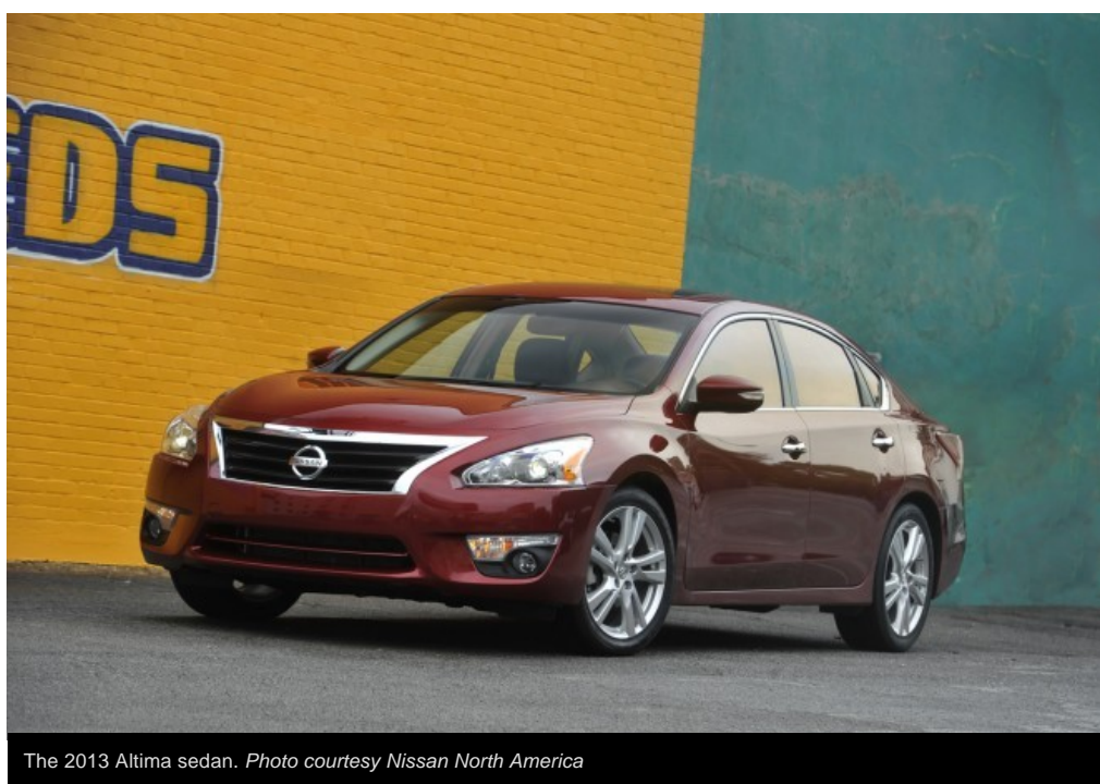
The 2013 Altima sedan.

subscribe to WIRED Subscribe to Wired Magazine Renew Give a gift Customer Service