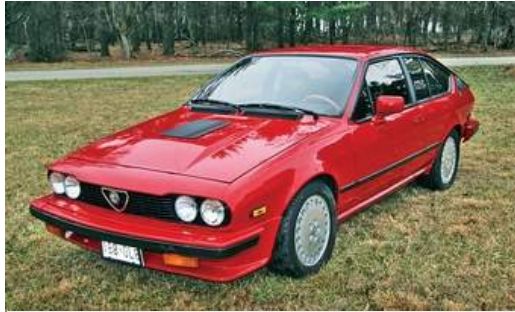
ZOOM 1985 Alfa Romeo GTV6